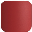
Locking Button Top View